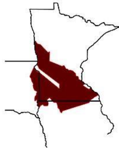
1851 Land Cessions

To achieve this, the DEIC plans to coordinate programs and events that highlight Indigenous people and culture in Golden Valley. Watch for more information on the City website and in upcoming publications.